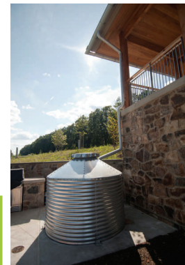
Nature Inn at Bald Eagle, one of this year’s Annual Green Building Award winners.